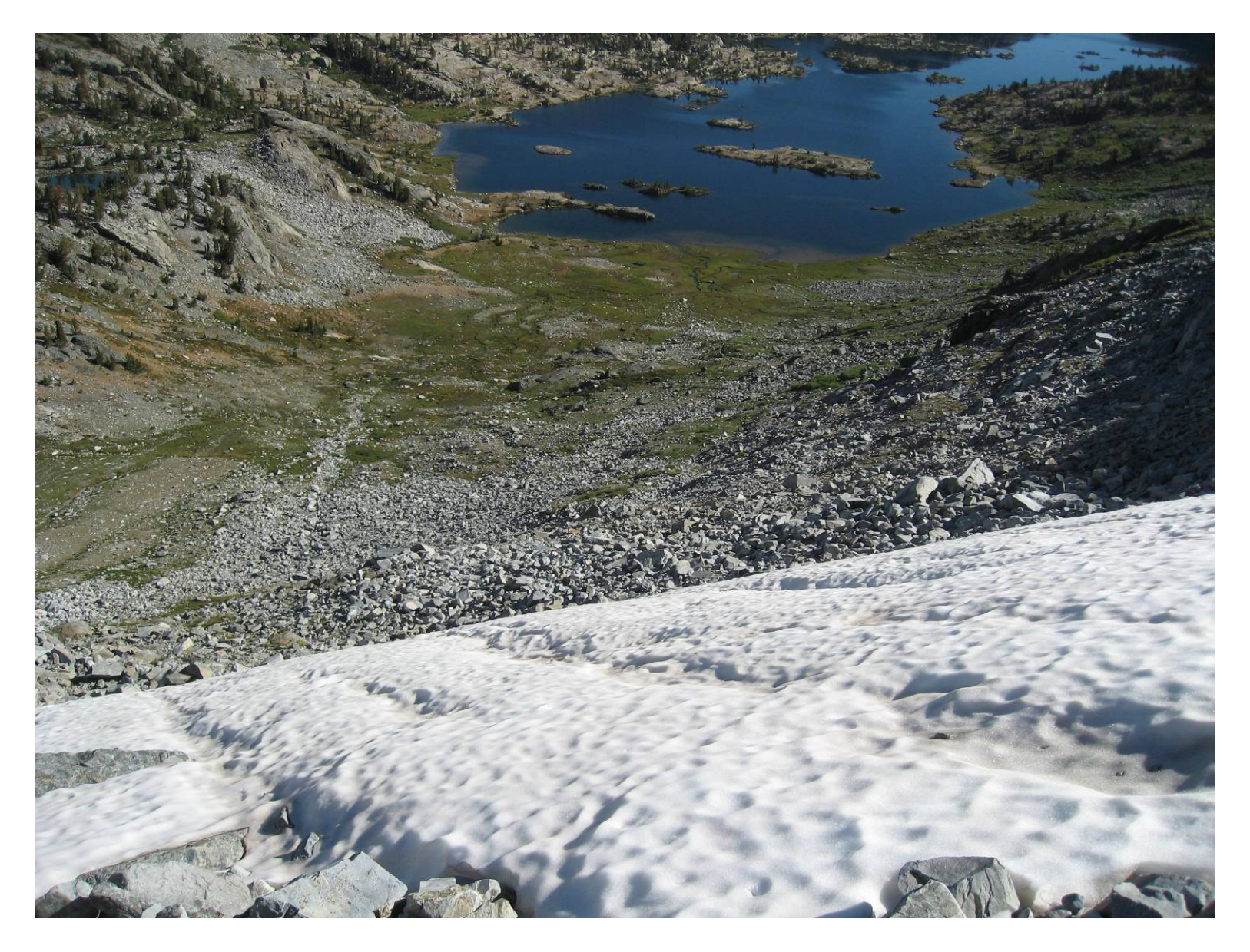
Looking down snowfield below north side of Whitebark Pass---don't go down this; go down rocks on the far right side of the pass