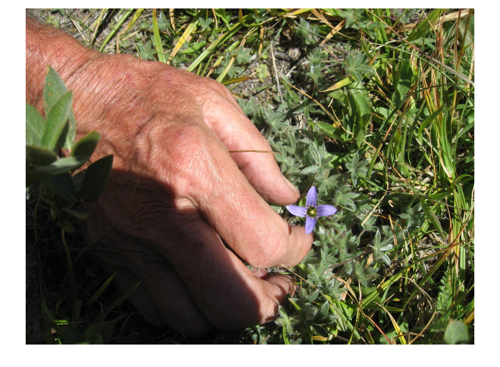
Lots of flowers, even in September.