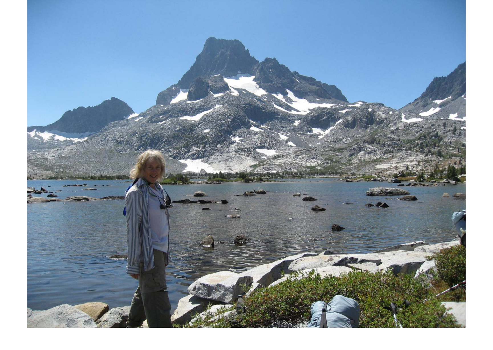
Banner Peak from Thousand Island Lake