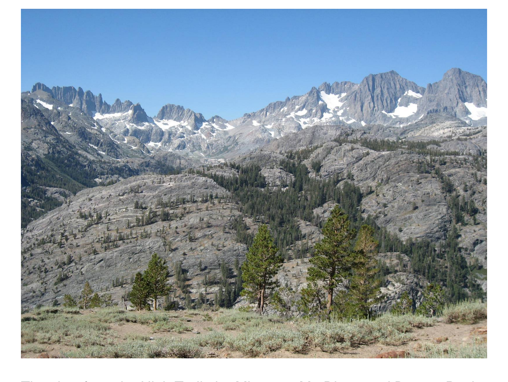
The view from the High Trail: the Minarets, Mt. Ritter, and Banner Peak