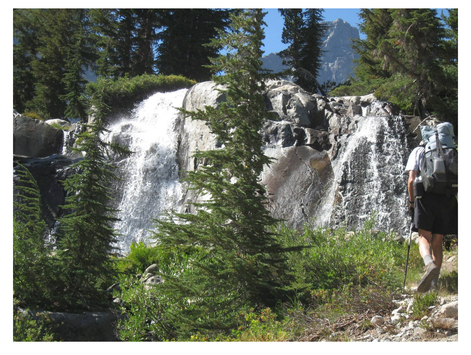
Along excellent use trail above Lake Ediza, ascending into valley leading to Mt. Ritter and Banner Peak