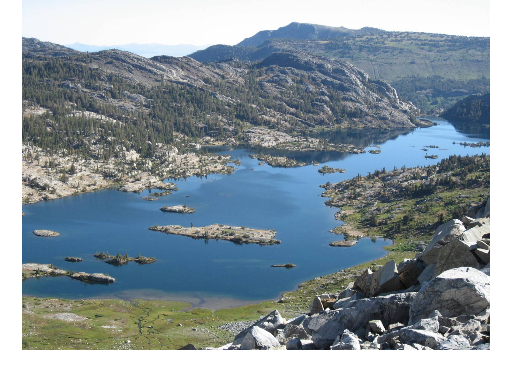
Garnet Lake from Whitebark Pass