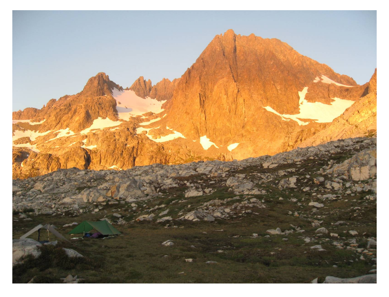
Sunrise, Mt. Ritter from camp above Nydiver Lakes