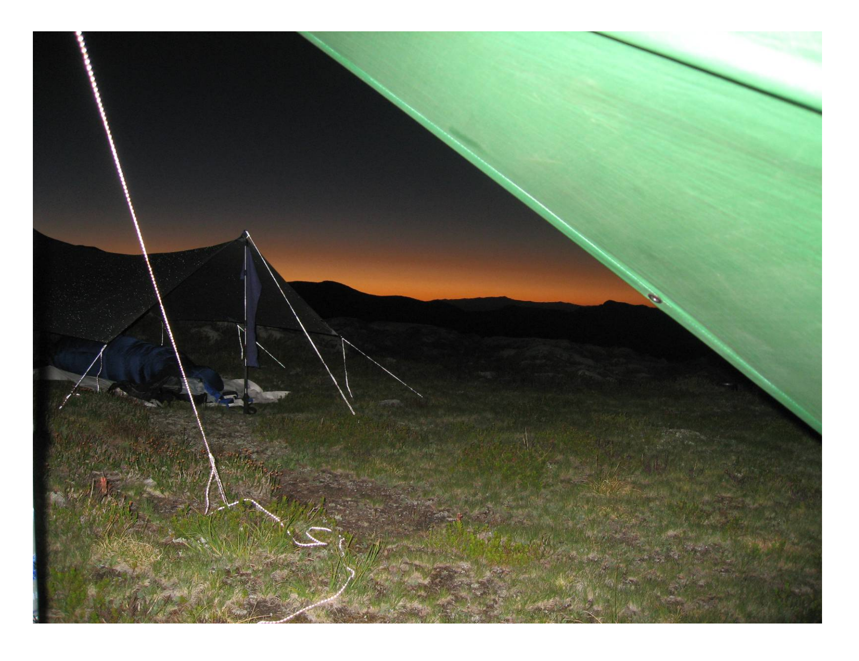
Pre-sunrise from camp above Nydiver Lakes