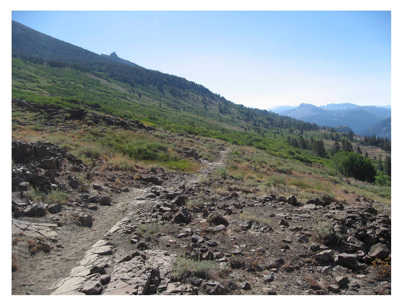
The High Trail, heading toward Agnew Meadow