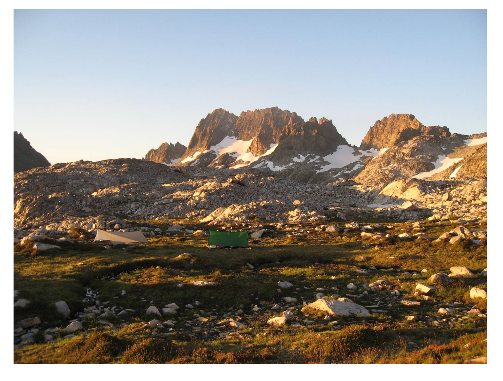
The Minarets from camp above Nydiver Lakes