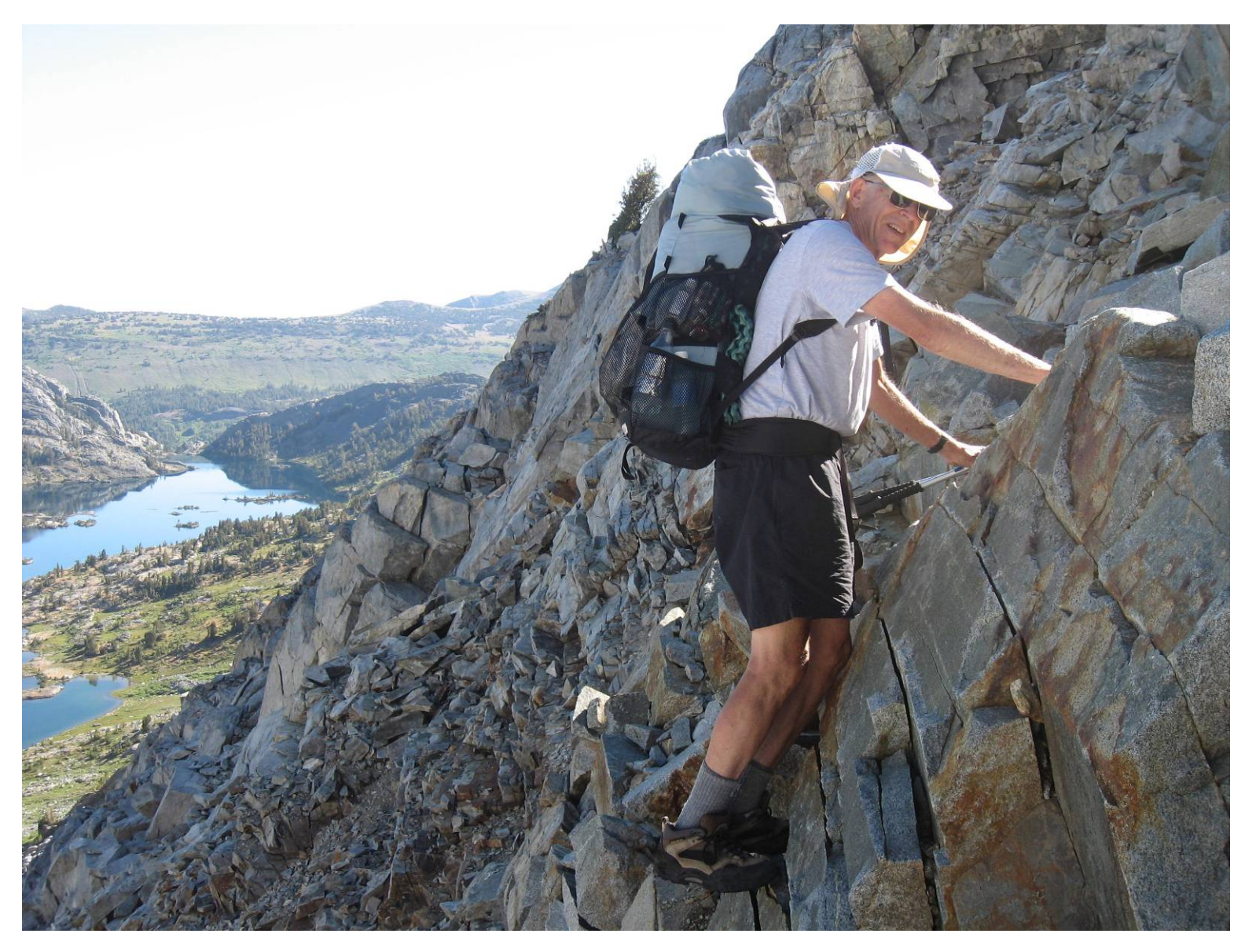
Descending the north side of Whitebark Pass; the descent is easy below this (and this part is very easy; there is little exposure below Dave's feet)