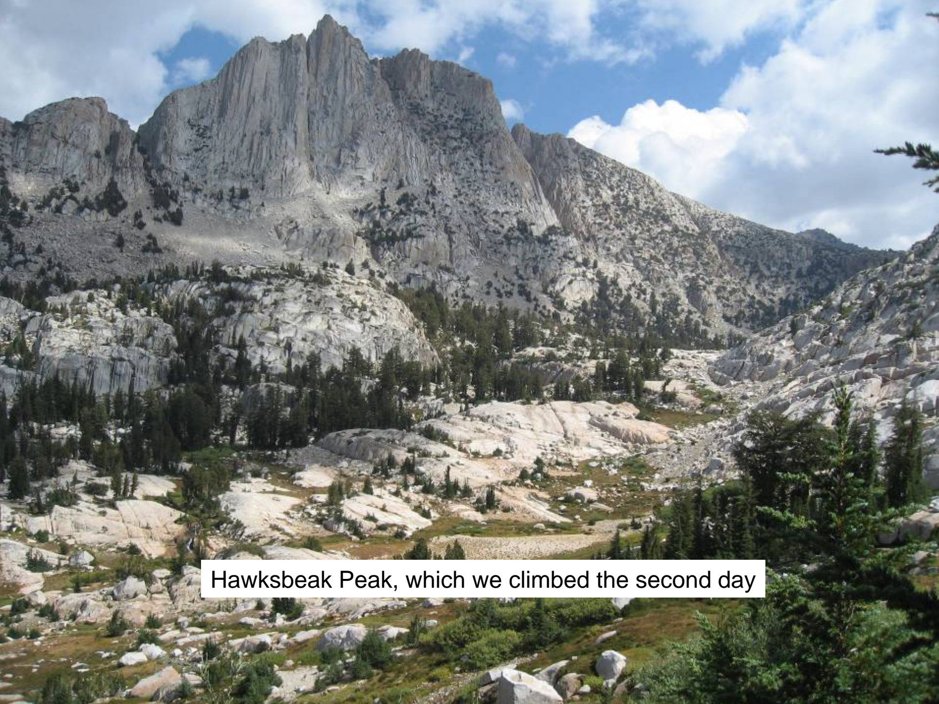
Hawksbeak Peak, which we climbed the second day