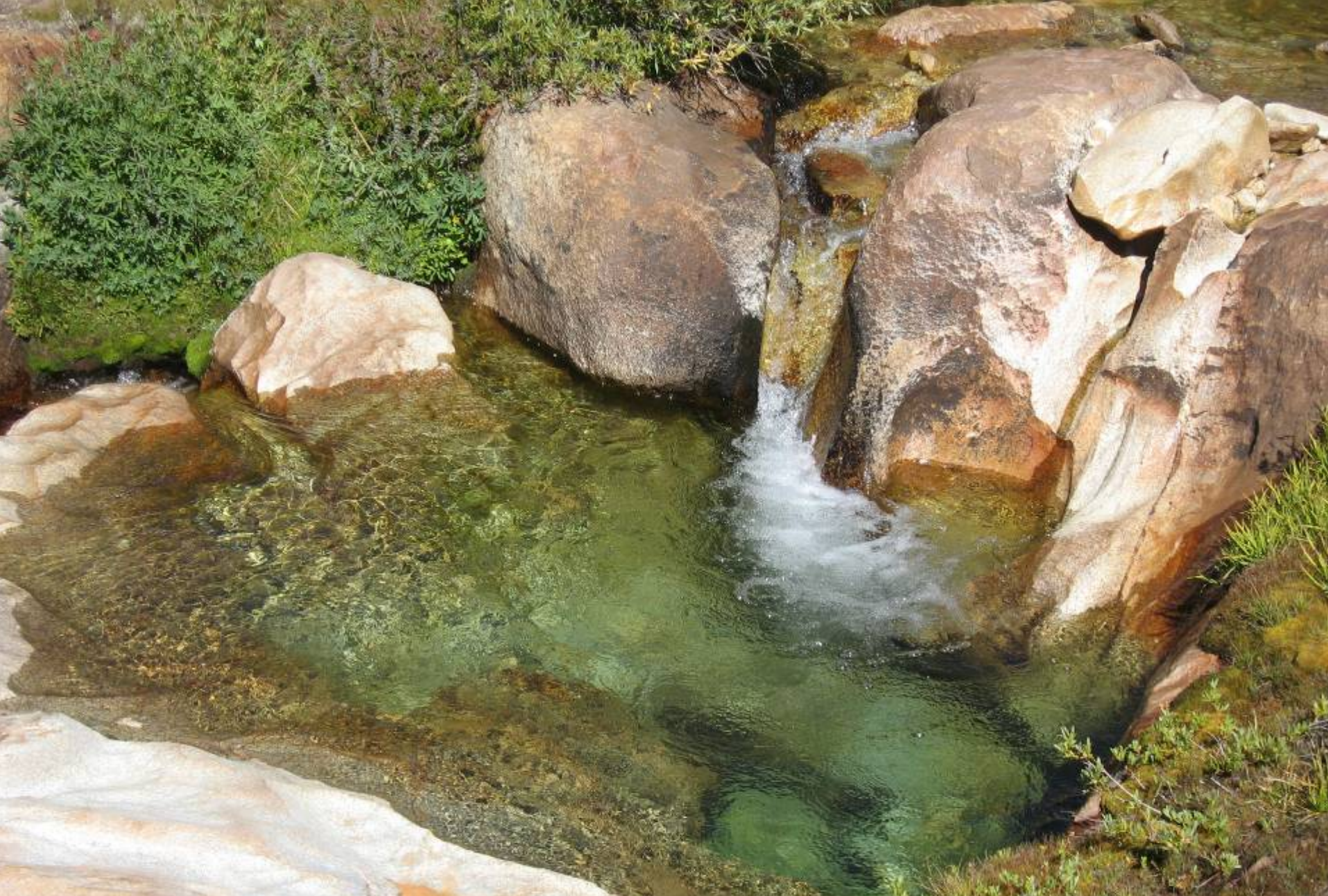
We followed a beautiful small stream during the second day's cross country