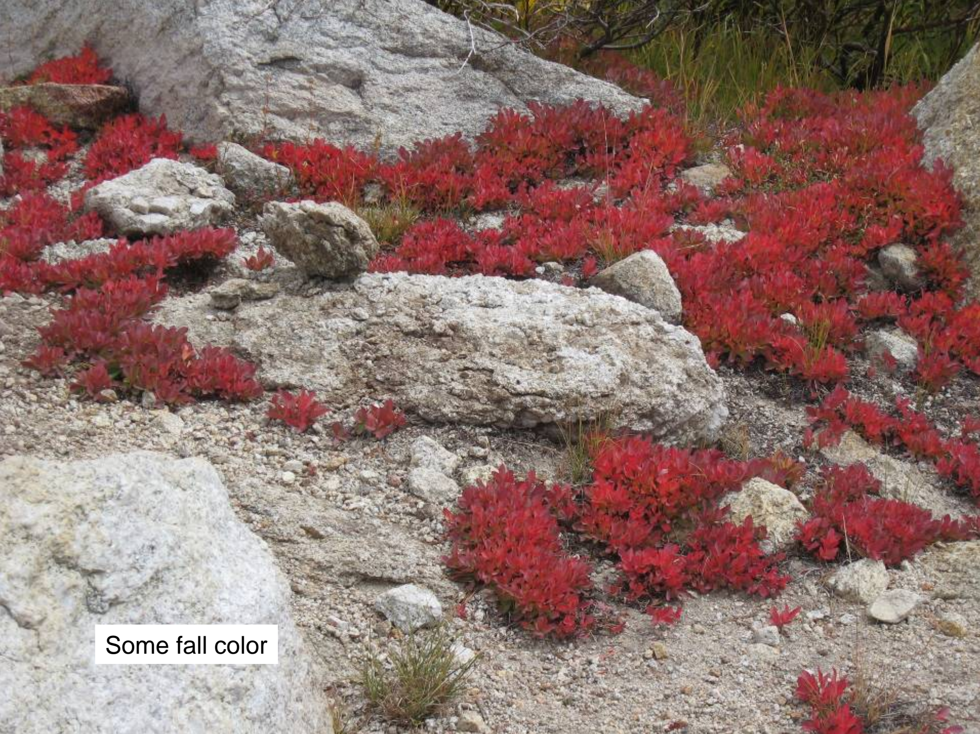
Some fall color