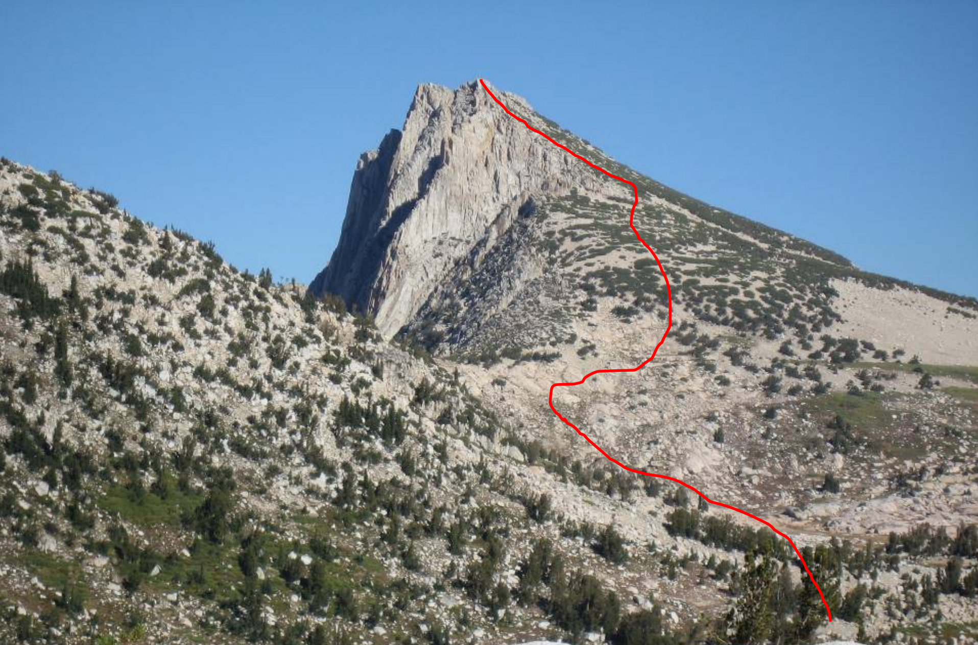
Luckily, there was an easy route to the top (only a small bit of class 3)