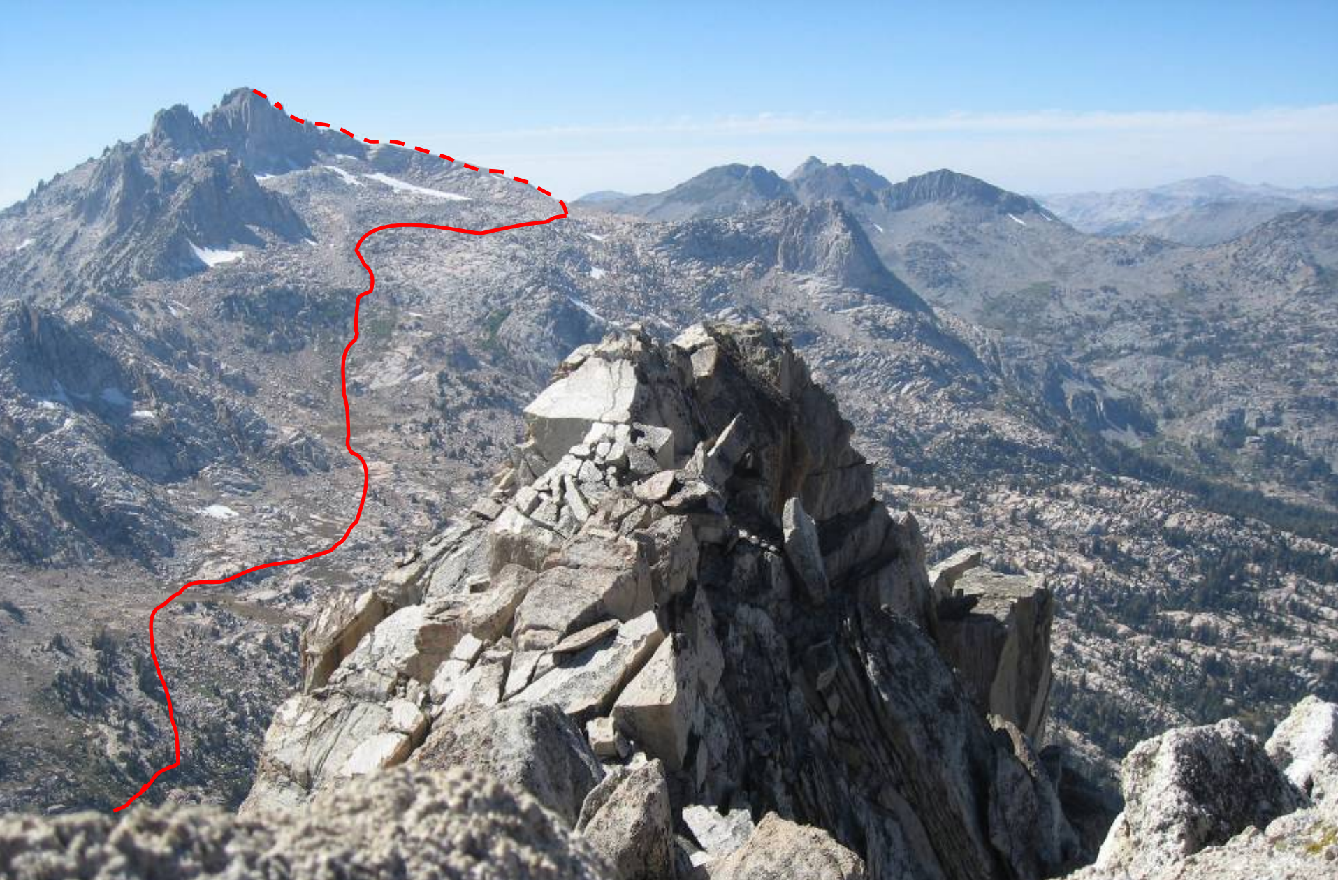
Tower Peak from Hawksbeak Peak; the line shows our route (dashed for the part we did not do)