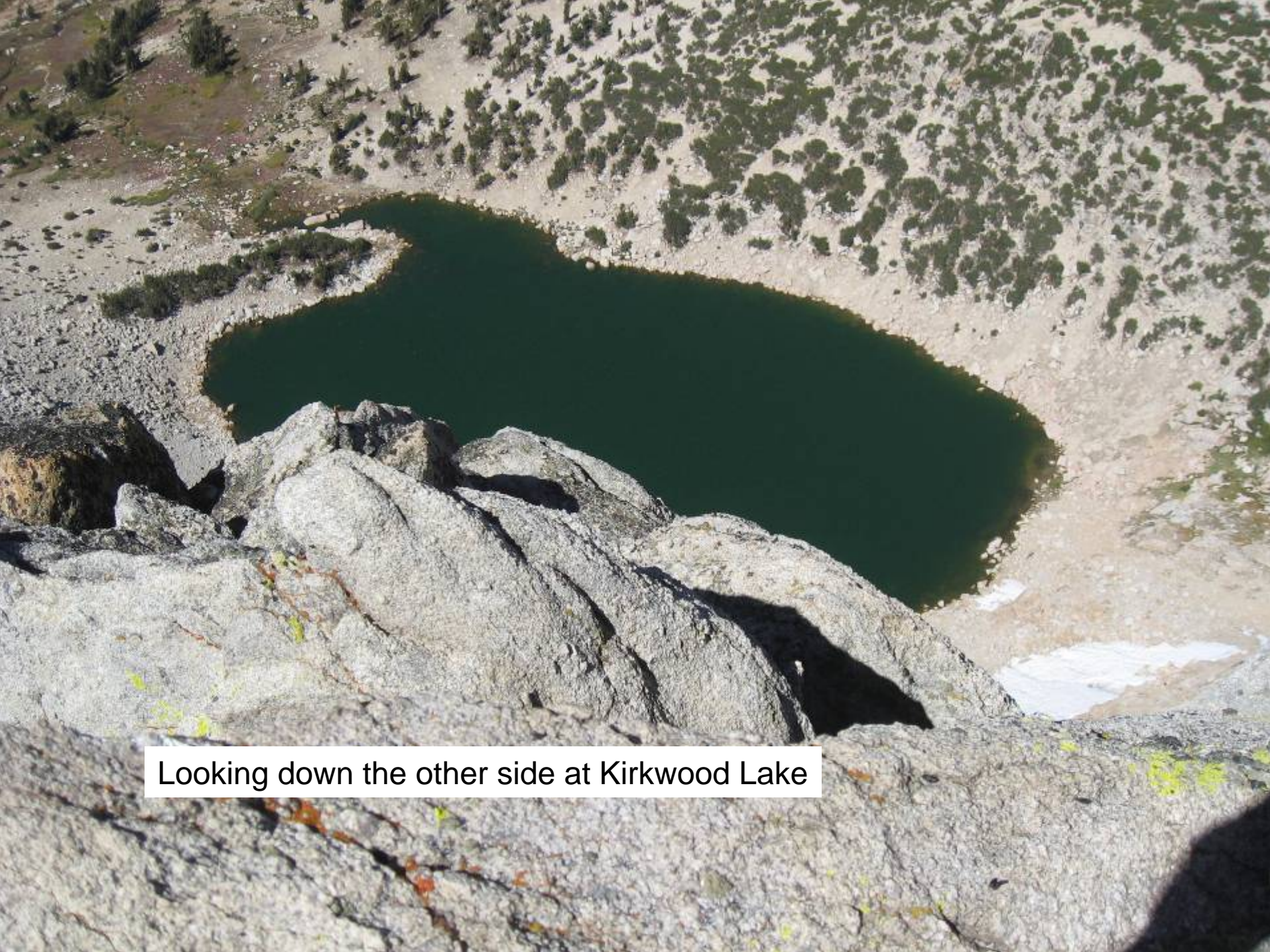
Looking down the other side at Kirkwood Lake