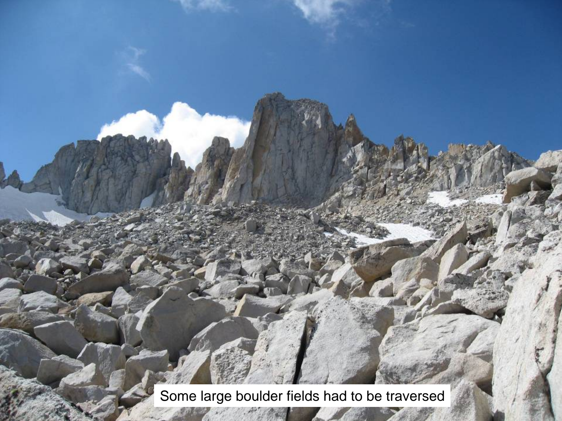
Some large boulder fields had to be traversed