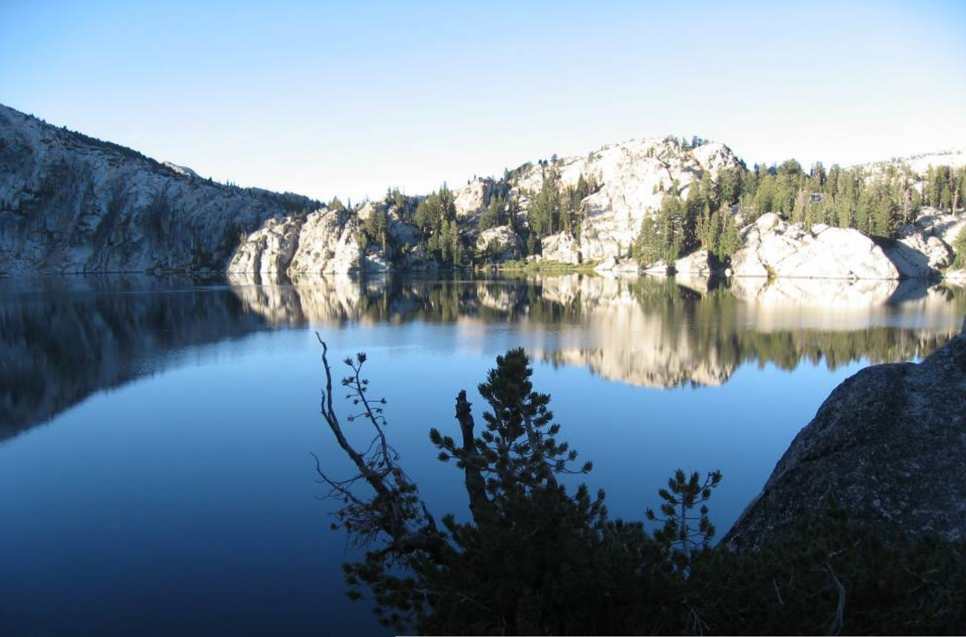
Peeler Lake, where we spent the 1st and 3 rd nights