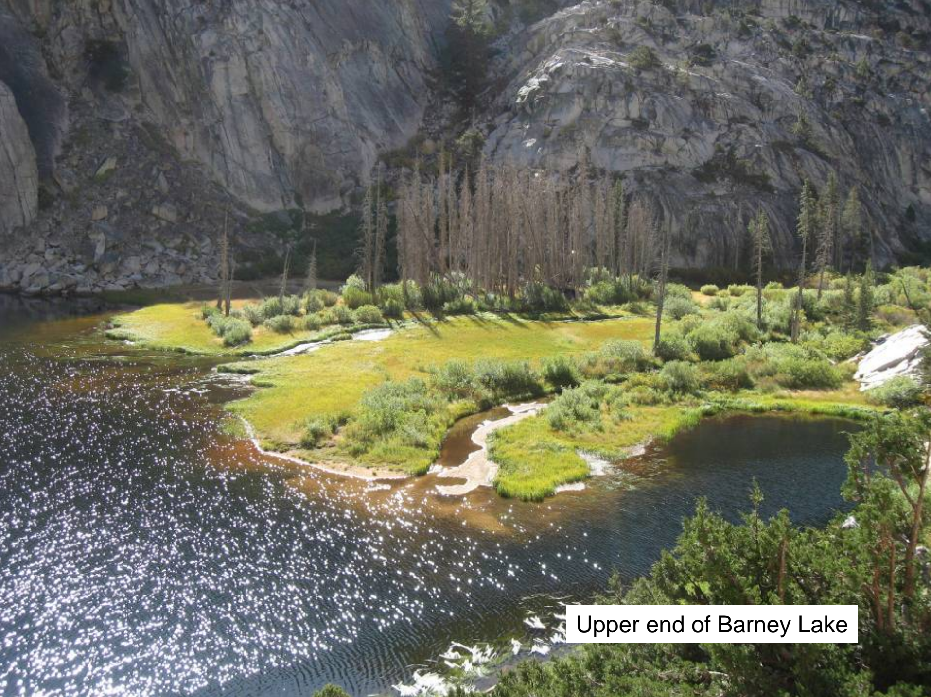
Upper end of Barney Lake