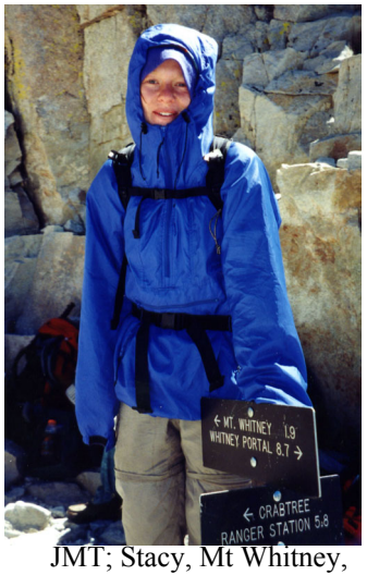
peak el. 14,494', Day 19