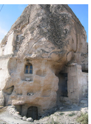
Cave home, Cappadocia, Turkey