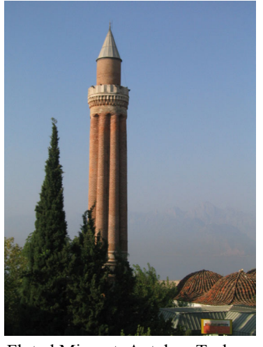
Fluted Minaret, Antalya, Turkey